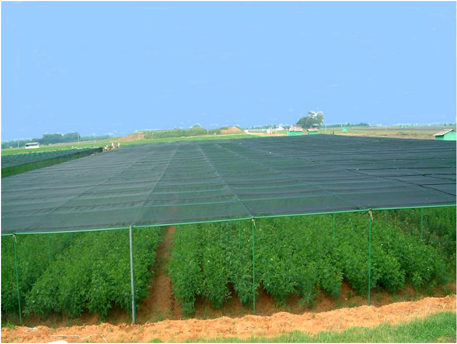
Figure 8.2 Field view of growing pigeonpea germplasm under insect-proof cages for regeneration.